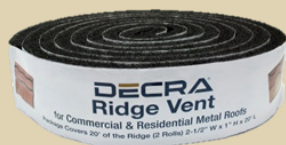
DECRA Ridge Vent